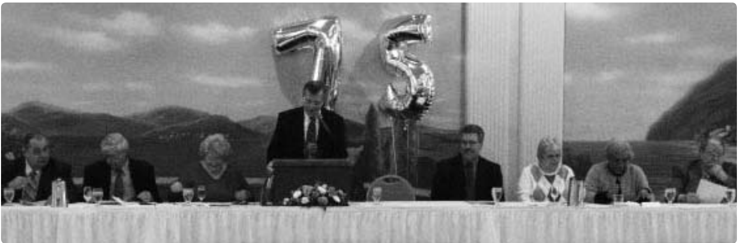
Credit Union Board of Directors