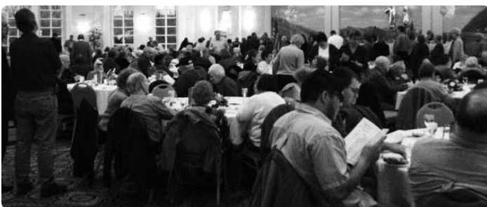
Credit Union members at meeting.